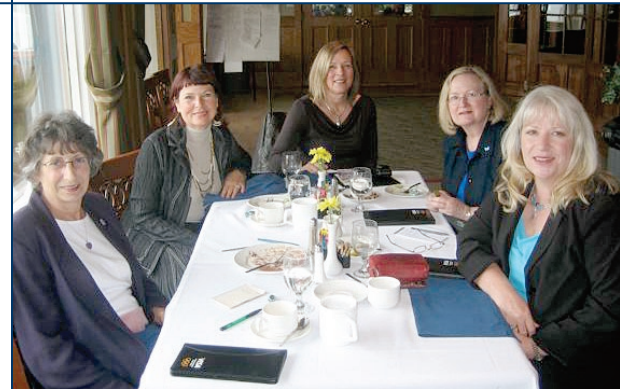
Members at the Victoria, BC meeting