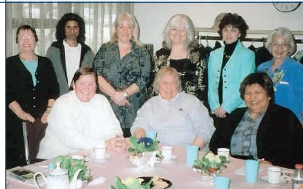
Members at the Vancouver, BC meeting