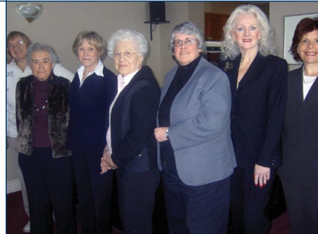
Annual Meeting 2008